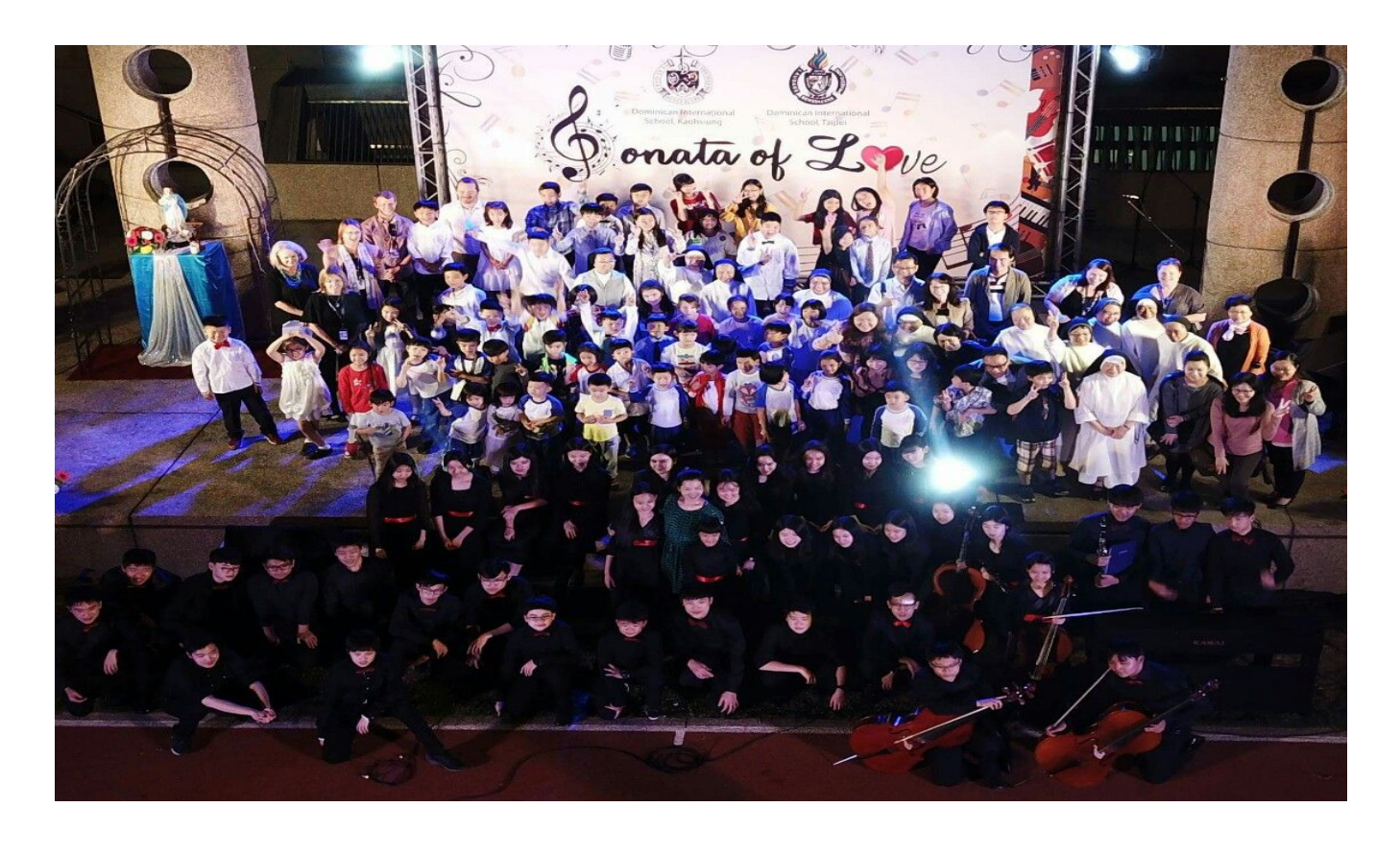
Thank you for all you do to support our school community!

This all-day activity will feature rotating stations (in the morning) focusing on learning the science of how our bodies move and work with sports events and class competitions in the afternoon.