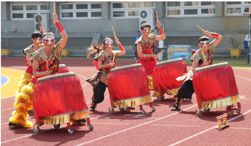
The drummers had everyone fascinated by their skills and the sound could be felt and heard! The lion dance is always a highlight .