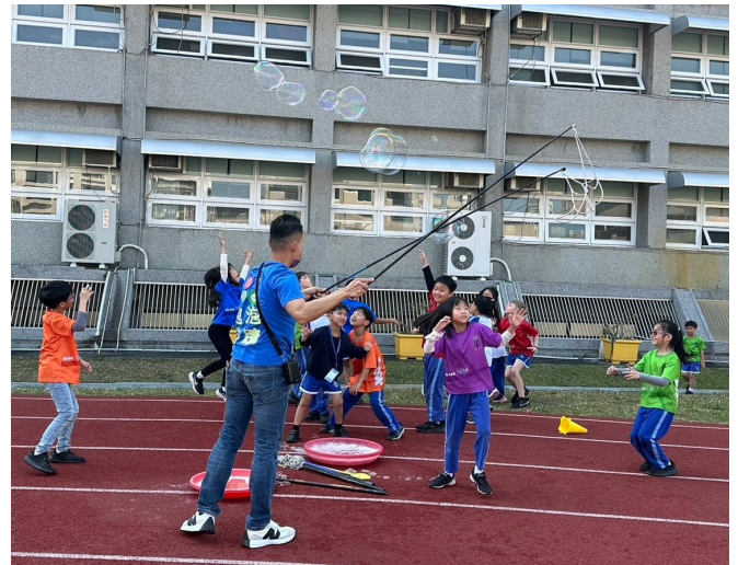
Fun with bubbles