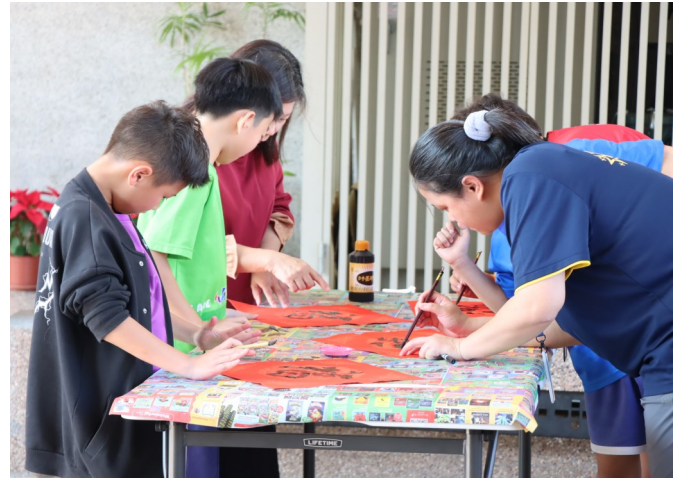
Traditional calligraphy is not easy!

We extend our heartfelt gratitude to everyone who participated, contributed, and supported this event. Your involvement made this celebration not only memorable but also a wonderful reflection of cultural appreciation and community spirit.